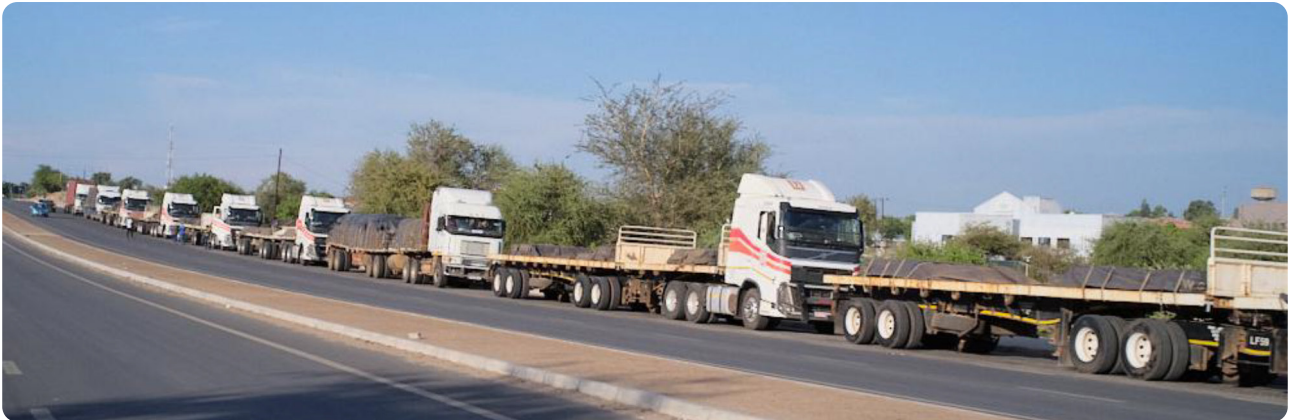
Commercial truck driver queues in front of the border post (November 2024).

There has also been a significant reduction in processing times and congestion for drivers due to more efficient infrastructure and clearing systems. Non-commercial drivers now cross the border in an average of three hours. For commercial drivers, the median crossing time is now 14 hours, which is a considerable reduction compared to an average of 35-65 hours previously spent crossing the border.