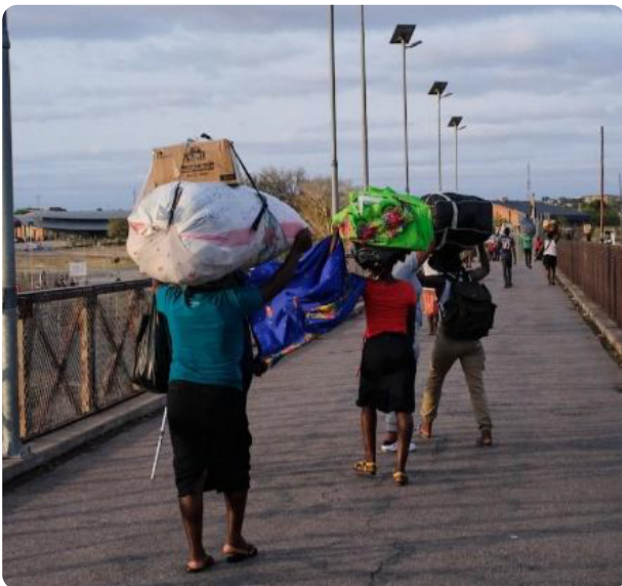
Local residents and women cross-border traders, carrying goods from the South African side of the border (Musina) to the Zimbabwean side (Beitbridge).

There has also been a significant reduction in processing times and congestion for drivers due to more efficient infrastructure and clearing systems. Non-commercial drivers now cross the border in an average of three hours. For commercial drivers, the median crossing time is now 14 hours, which is a considerable reduction compared to an average of 35-65 hours previously spent crossing the border.