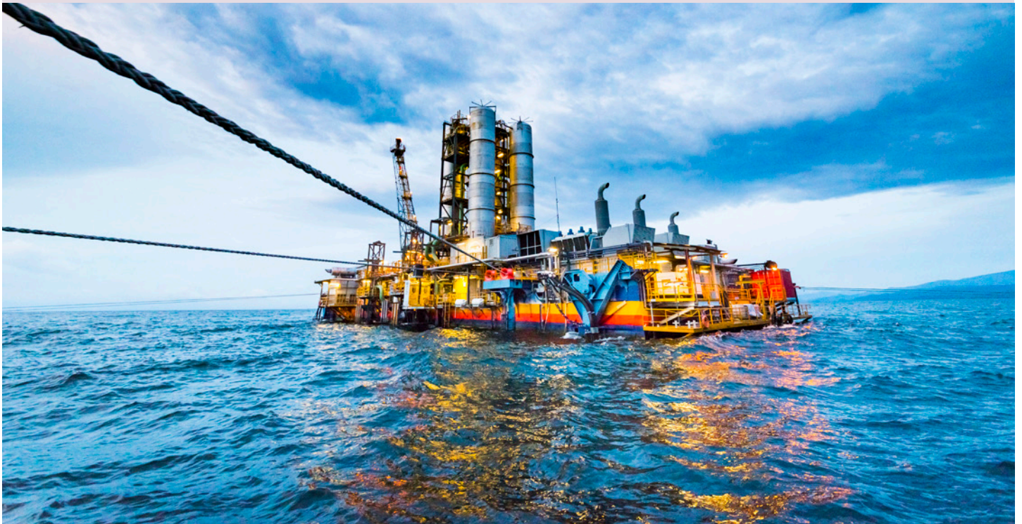
KivuWatt | Rwanda | With ContourGlobal | Photo courtesy of ContourGlobal

The unique project has overcome significant technical barriers, using floating barges to extract methane from the bed of Lake Kivu to generate much-needed power. Almost 2.5 million people have gained access to the 25MW of power created by the plant; substantially boosting Rwanda's 85MW installed capacity.